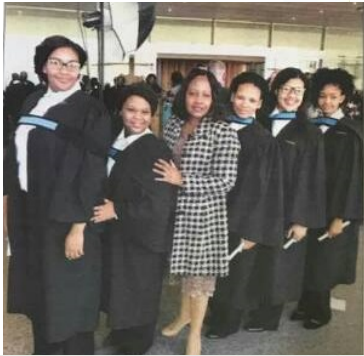
women in tourism