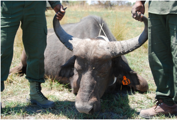
Fig 2 Photograph of a collared adult female buffalo from Mahango National Park in Namibia, with highly visible ear tag containing a unique identifier

Botswana into Khaudom National Park, which retains a tiny remnant buffalo population. From there, the animals split into two groups, with one group spotted in Angola near the Kavango river, around 250 km from where they had been ear-tagged (Fig. 1, white dashed line). Another ear-tagged animal was eventually shot in an agricultural area in the Otjozondjupa Region in central Namibia (Fig. 1, grey dashed line). This location was a staggering 500 km from where she was tagged, far outside what is considered current buffalo range in Namibia.