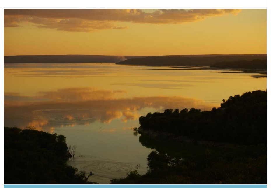
The magnificent Massingir Dam, measuring 103 km² and featuring an abundance of bird life

Spatial Monitoring and Reporting Tool (SMART) training was undertaken and equipment distributed to commence the data collection process.