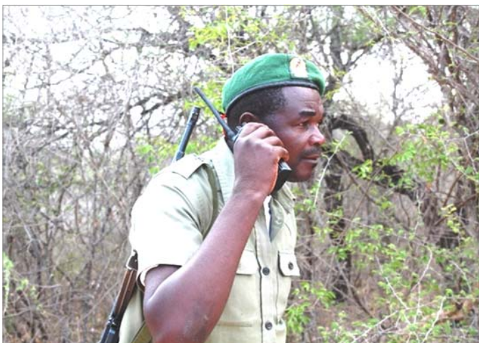
In December, the Rhino Protection Programme, a partnership between the South African Department of Environmental Affairs, South African National Parks, Peace Parks Foundation and Ezemvelo KZN Wildlife, donated equipment to the value of R2.6 million to strengthen Mozambique's environmental law enforcement efforts and support the rangers and police corps at the frontline of the poaching crisis. The donation included an aircraft and followed on an investment in a R1.78 million digital communication system, completed in October.