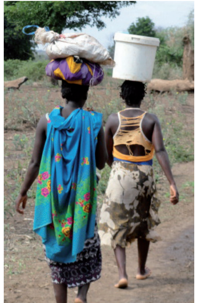
No other region in the world has taken up the TFCA concept as seriously as SADC.

Another set of regional guidelines on concessions also focuses on the participation of local communities in the establishment of cross-border tourism products.