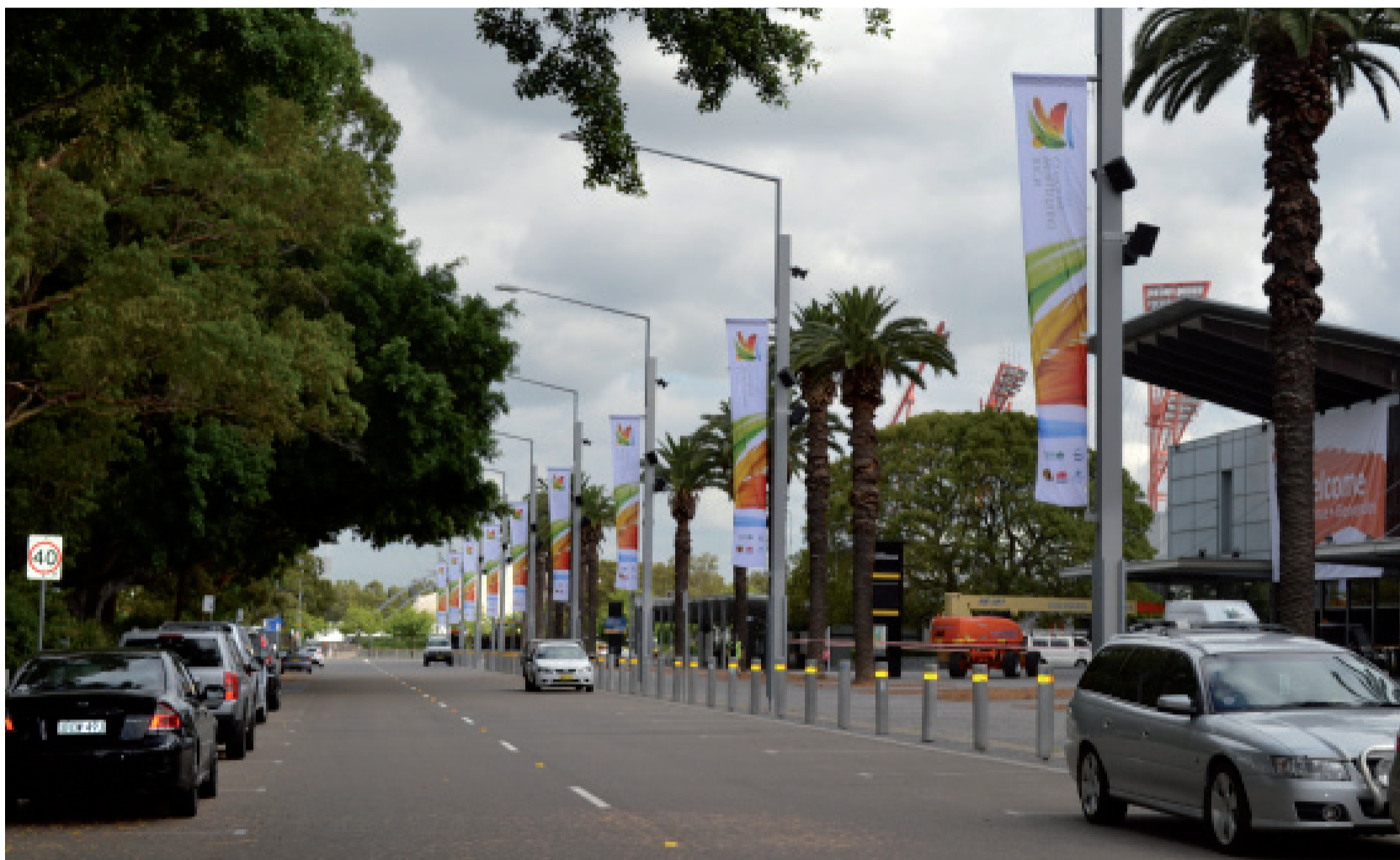
All is set for the 2014 World Parks Congress which is being held at eight venues within the Sydney Olympic Park.