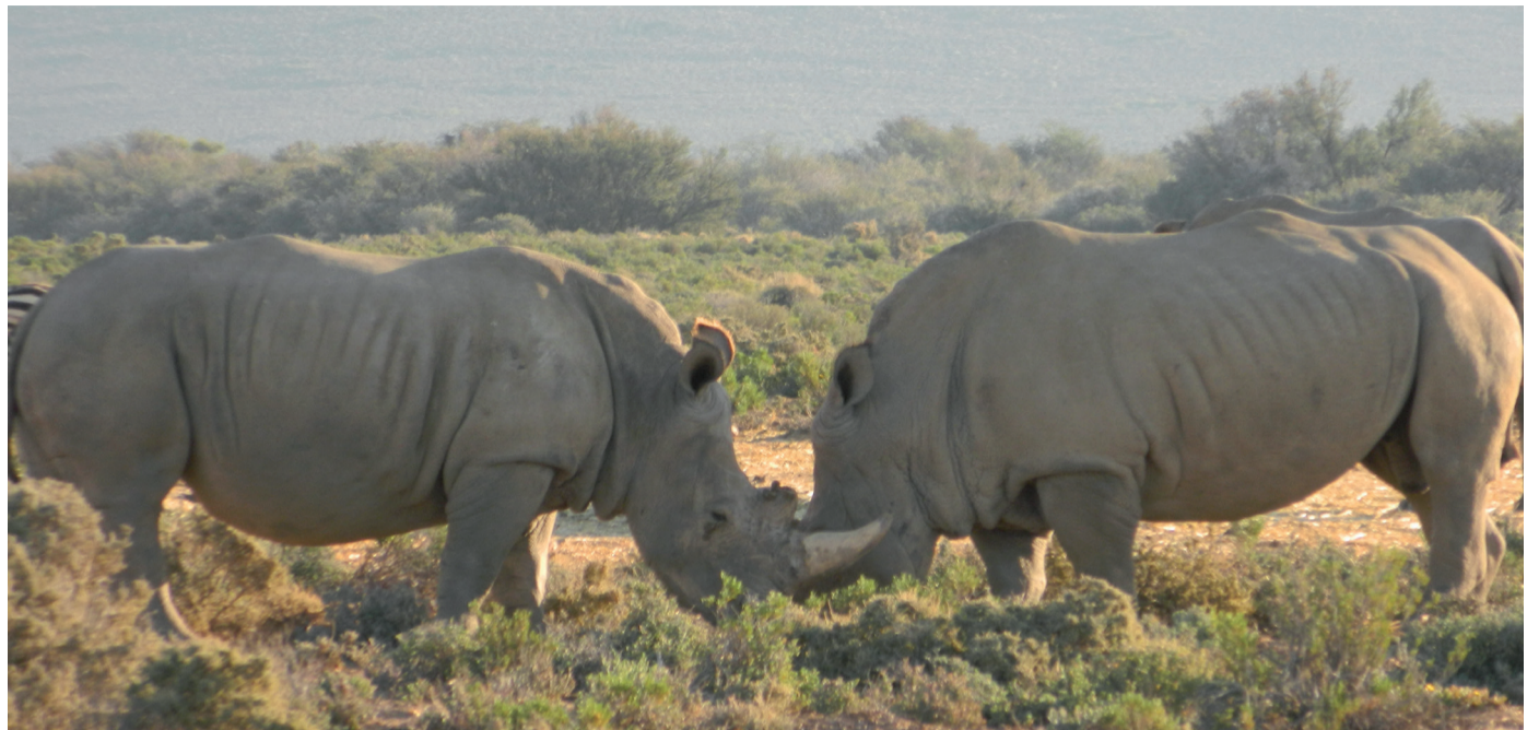
South Africa's white rhinoceros recovered from near-extinction thanks to intense conservation efforts.

Malawi's Minister of Tourism and Wildlife Kondwani Na-