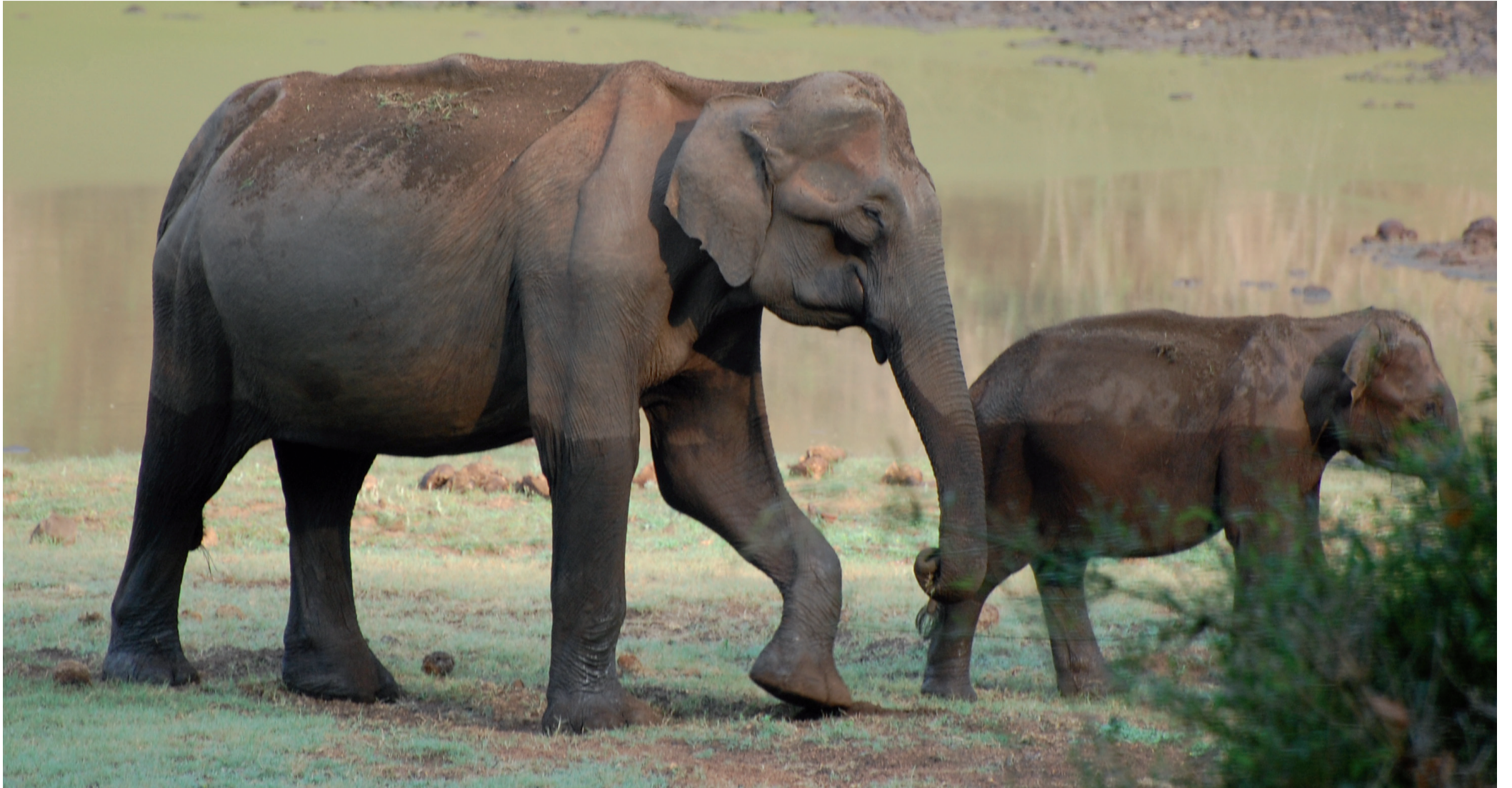
A critical approach to managing wildlife and community development is one founded on sustainable development.