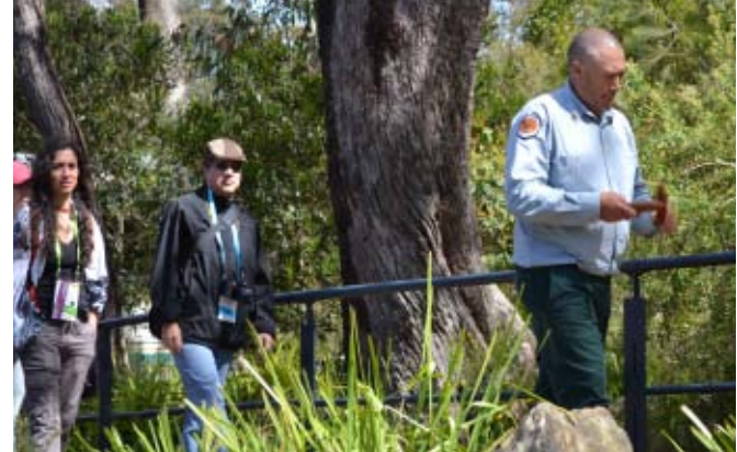
A tribal aboriginal clan member takes the guests through a welcome 'smoking' ceromony at the entry point of the Wentworth Waterfalls in the Blue Mountains Area.

the mountains presented a delightful setting for the Wentworth waterfall. "Why are the mountains named Blue Mountains," a seemingly puzzled but yet inquisitive delegate asked.