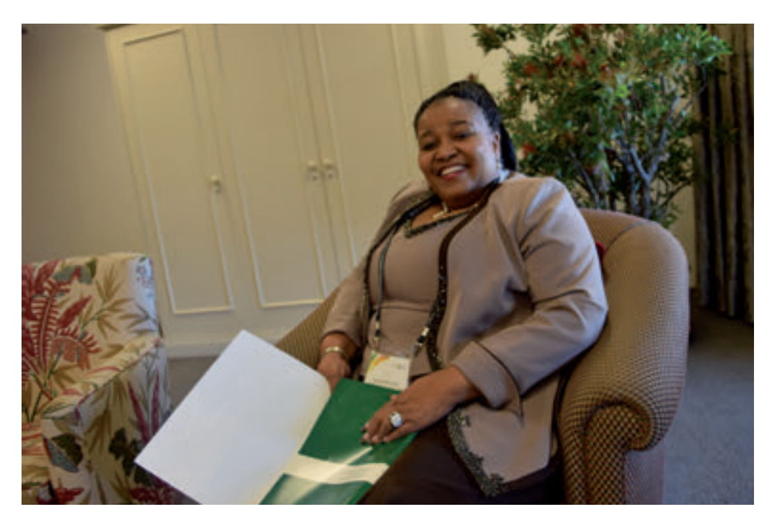
Minister, Edna Molewa

Vusumuzi Sifile speaks to South Africa's Minister of Environmental Affairs Edna Molewa on rhino conservation, and their efforts to engage with the international community.