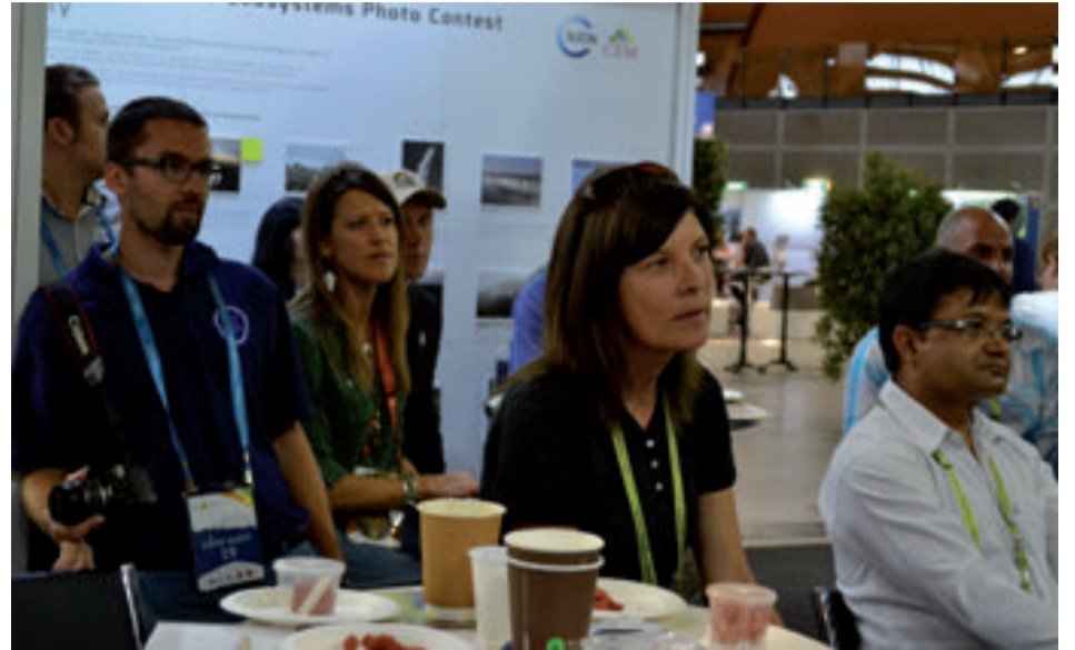
SADC delegates listen in to the discussion on Human - Wildlife conflict

It includes pledges from governments, international organizations, the private sector, Indigenous leaders, community groups and individuals, with many more still being recorded.